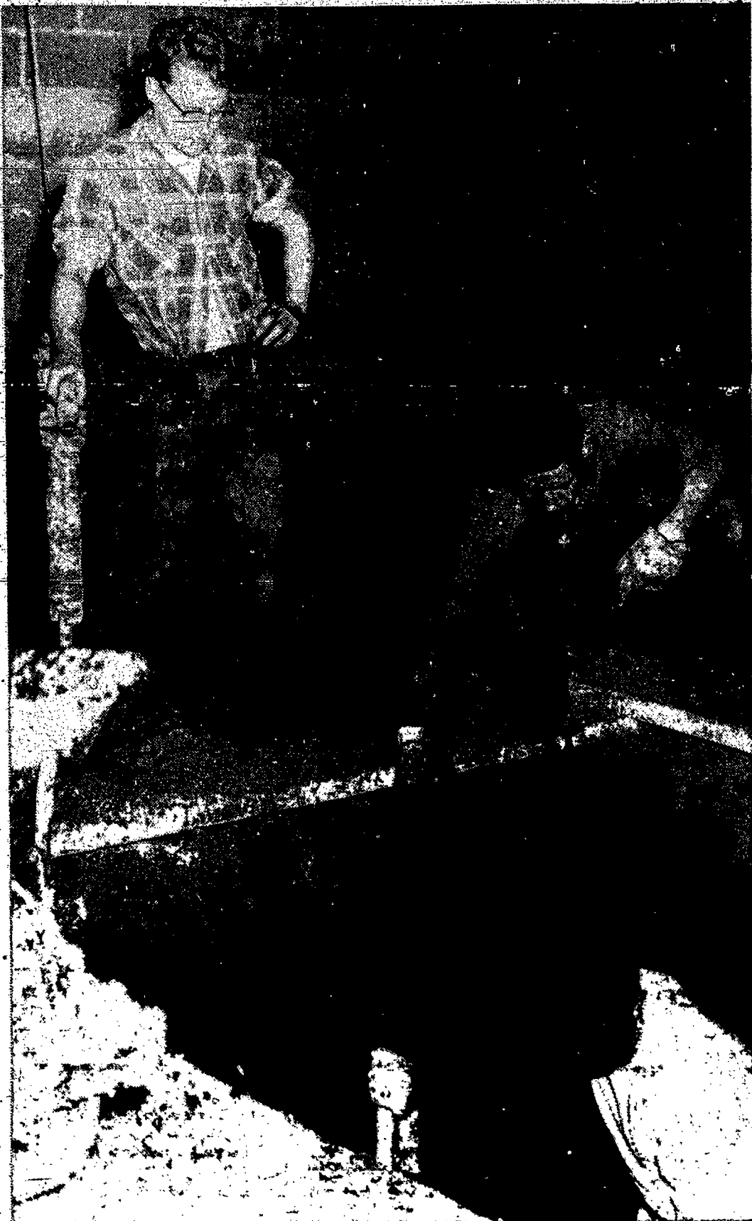
Down in the cellar of McQuaid Jesuit high school, Rochester, science students are digging a hole and they tell you they're looking for an earthquake. The story below will tell you how they might find one.