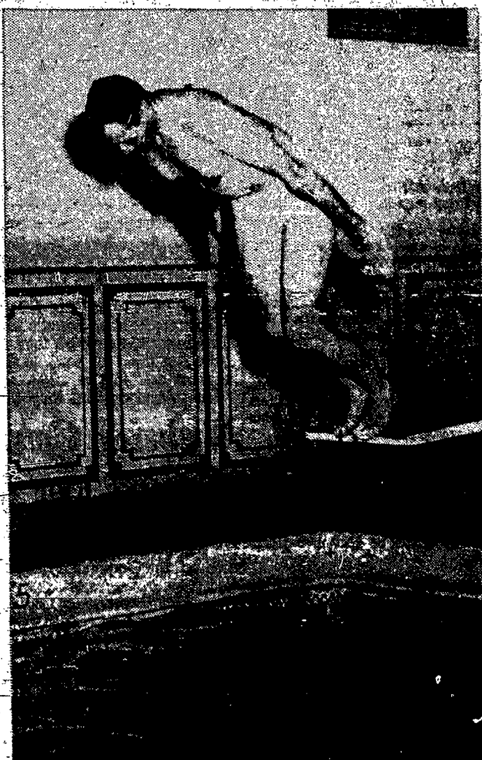
TAKING ADVANTAGE of the CYO during the noontime period, this businessman is one of several who go to the Columbus Civic Center daily for a recreational workout.

great parts of the CYO are the basketball and softball leagues conducted for grammar and high school children.