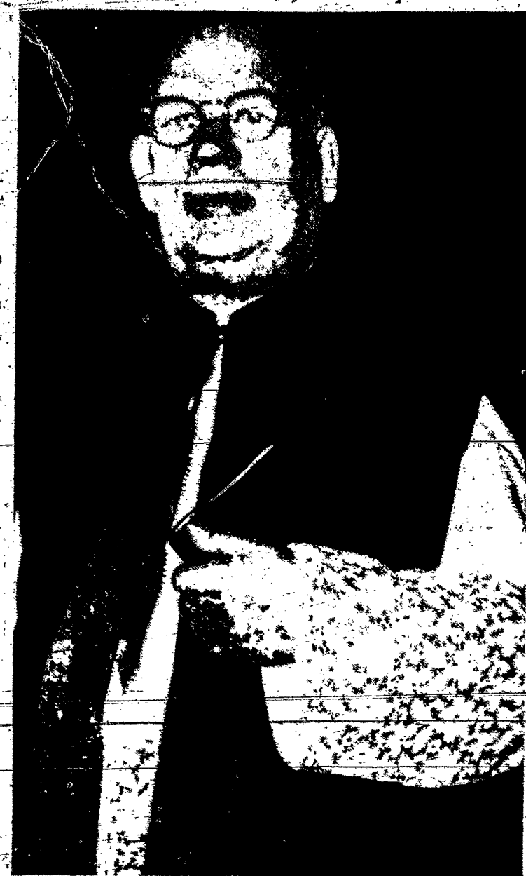
25 Years At St. Stanislaus