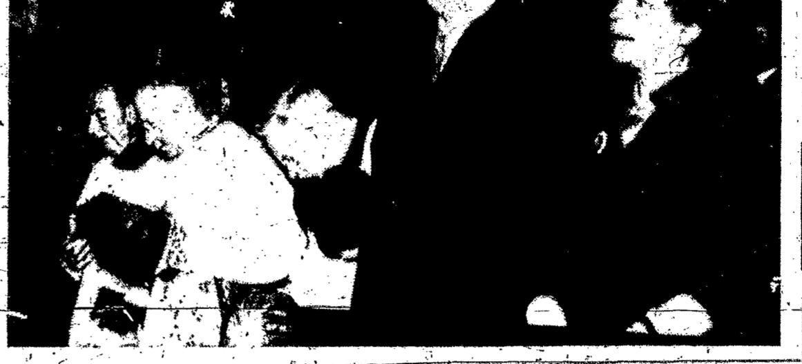
Annual Pan American Mass Said