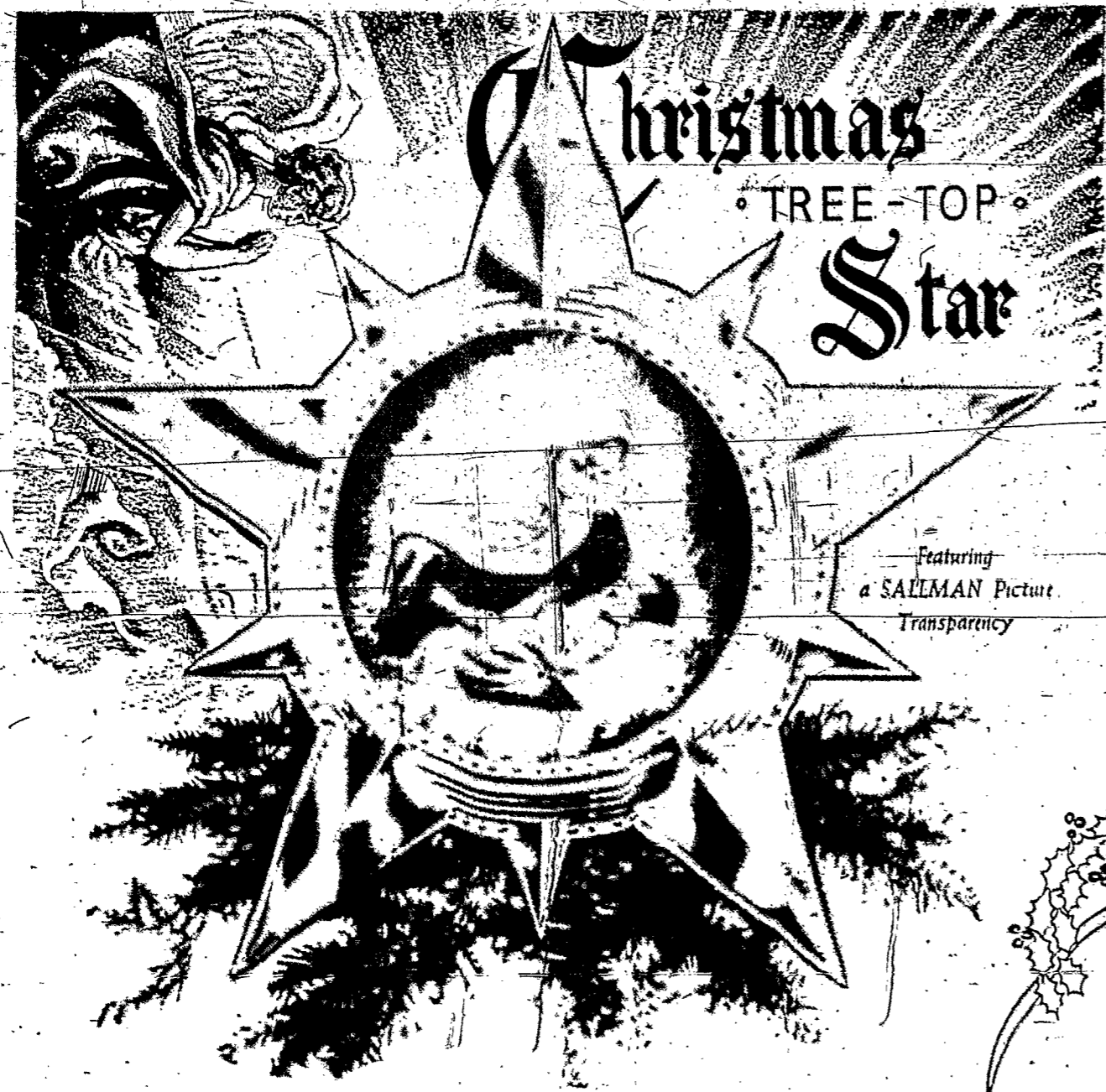
Featuring a SALLMAN Picture Transparency

Complete your Tree with this Beautiful Christmas Star metalized with Silver Plating. In the center of the star a full color transparency of Sallman's painting of "The Nativity", individually packaged in attractive box. A magnificent tribute to the Birth of Our Lord, 7 1/4" in diameter.