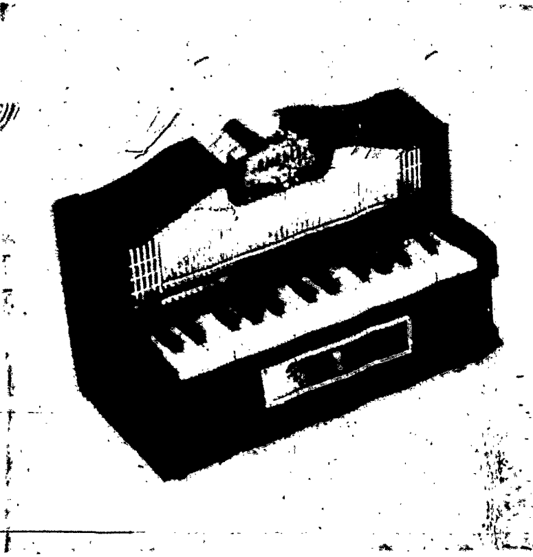
Electric Golden Pipe Organ 19.95

So fast, so realistic! Every offensive or defensive play in real live hockey can be performed. Players actually make bodily contact and can block, pass, stick-handle, shoot and even rebound the puck off the boards. Red light flashes when goal is scored. Rink size 18x36". Complete with replica of Stanley Cup.