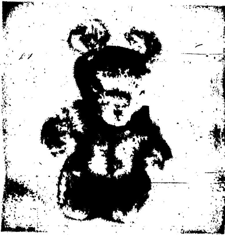
Giant Teddy Bear 9.98

A magnificent, handsomely finished golden pipe organ. 27 black and white keys play sharp and flats... over 2 full chromatic octaves with true full bodied organ tone. Footpedal on off switch. Comes with music book and electric cord.