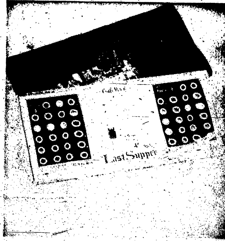
Last Supper Paint-by-Number Kit 4.98

Imported from Italy, this puppet theater offers all sorts of play possibilities! Sturdy wooden frame with changeable backdrop and wings for interior and outdoor scenes. Gold fringed red curtains pull open and shut on a traverse rod.