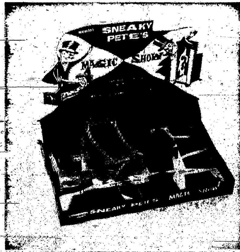
Professional Magic Show 6.98

A cuddly, lovable bear all children will take to their hearts! He stands a big 9" tall, is filled with kapok so he's soft and light. Teddy has a luxurious coat of long pile plush in tan or white. A feature parents will approve, safety, no pull eyes.