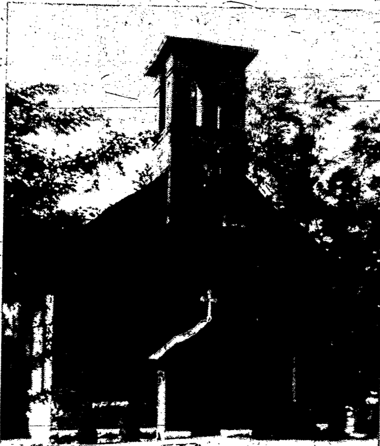
EXTERIOR VIEW of St. Patrick's Church, Aurora, shows that the edifice follows the classical lines of churches built prior to 1950.