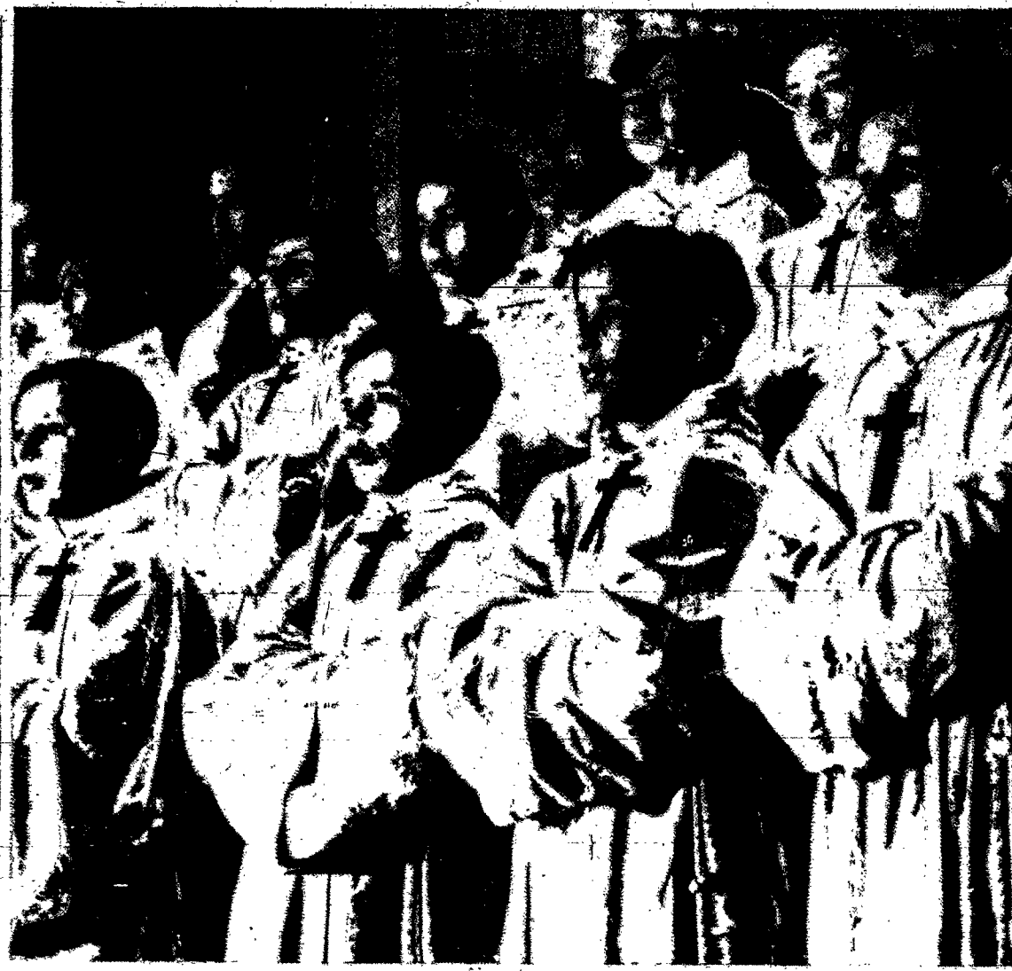
French boys choir "The Little Singers of Jesuit Martyrs for feast day rites this Sunday" will be at Auriesville Shrine of the

Los Angeles—(NC)—Fifty members of the Los Angeles Catholic Alumni Club have formed a weekend work party to help construct a new school section at Palm, one of the last California missions still serving Indians.