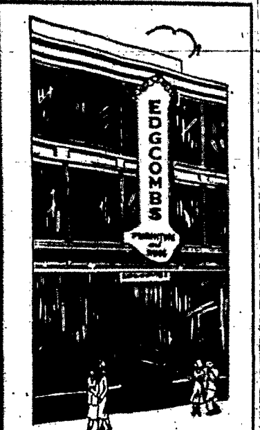
161 N. Main St., Elmira Opposite Mark Twain

A squad of 35 men has had intensive practice for the opening game against Watertown High