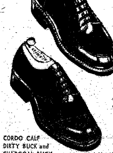
CORDO CALF DIRTY BUCK and CHARCOAL BUCK

$8.50 to $10.95 - According to Size Sizes for Youths, Boys and Men