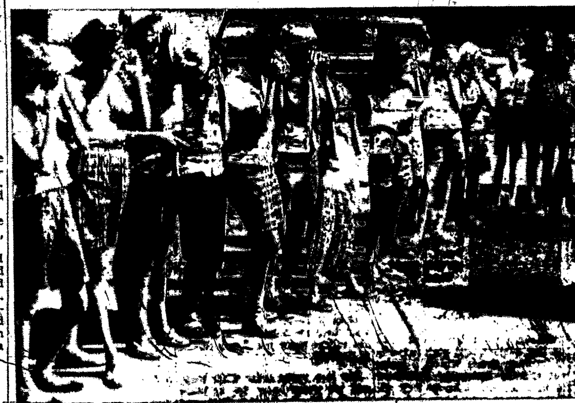
SNAPPING THE STAFF—When the photographer posed the Camp Columbus staff for a picture on turning around to take the photo he found this battery of snap shooters, all Camp Columbus campers.