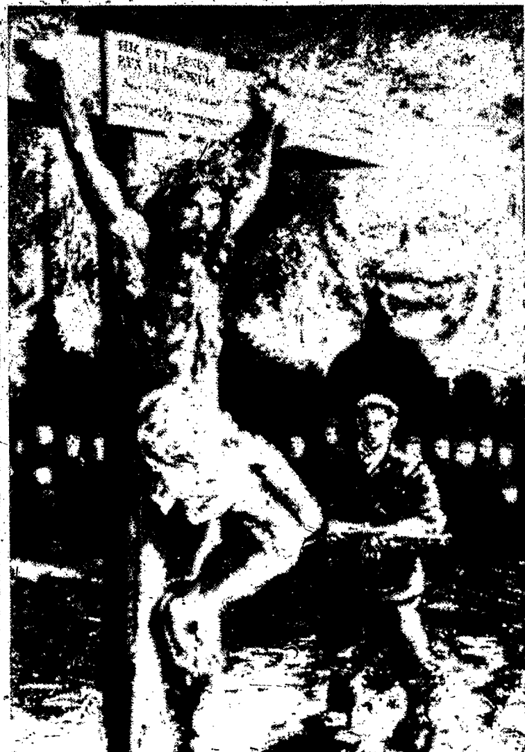
'The Church Of Silence'

Buffalo — (NC) — This is not a pleasant picture, but it is not meant to be. The symbolic picture shows an armed guard holding back his own people from religion and from Christ. The people, in a long, silent row stand for "The Church of Silence." The blood of 10 years of Red rule flows freely on the ground and the holocaust in the sky portrays the burning of churches in various countries since Communism came into power. The grinning face of Russia's dictator is formed by the fiery sky, grinning at what he believes is his victory.