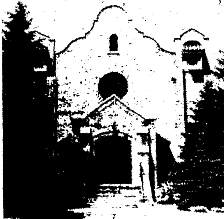
BETWEEN THE PINES in Cohocton

Parish records tell us that the church was built in 1881—also