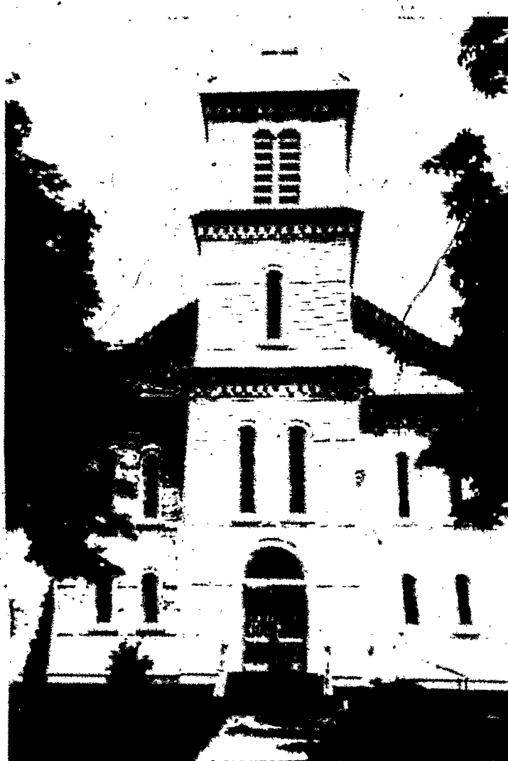
APPROACHING Perkinsville Church

of Prayer, the Sodality and the Holy Childhood Sodality.