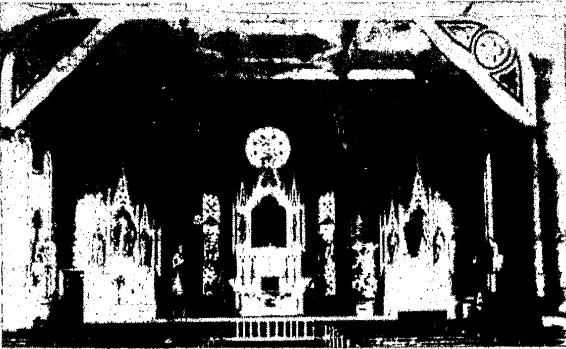
INTERIOR BEAUTY of Sacred Heart of Jesus Church in Perkinsville.

The first Mass in the new church was celebrated by the Rev. A. Schwaiger on Nov. 30, 1850. This edifice served its predominantly German speaking parishioners until 1883 when the present church was built. The old building is still in use, however, serving as the town's general store and post office, being moved by the town's people so that the new church could be built.