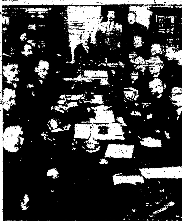
Lenin presides at Kremlin meeting in early 1920's. His strategy of ruthless control laid foundation for present wide-spread Communist power and influence.

A FRONT IS an organization which the Communists openly or secretly control. The Communists realize that they are not welcome in free society. Party influence, therefore, is transmitted, time after time, by a belt of concealed members, sym-