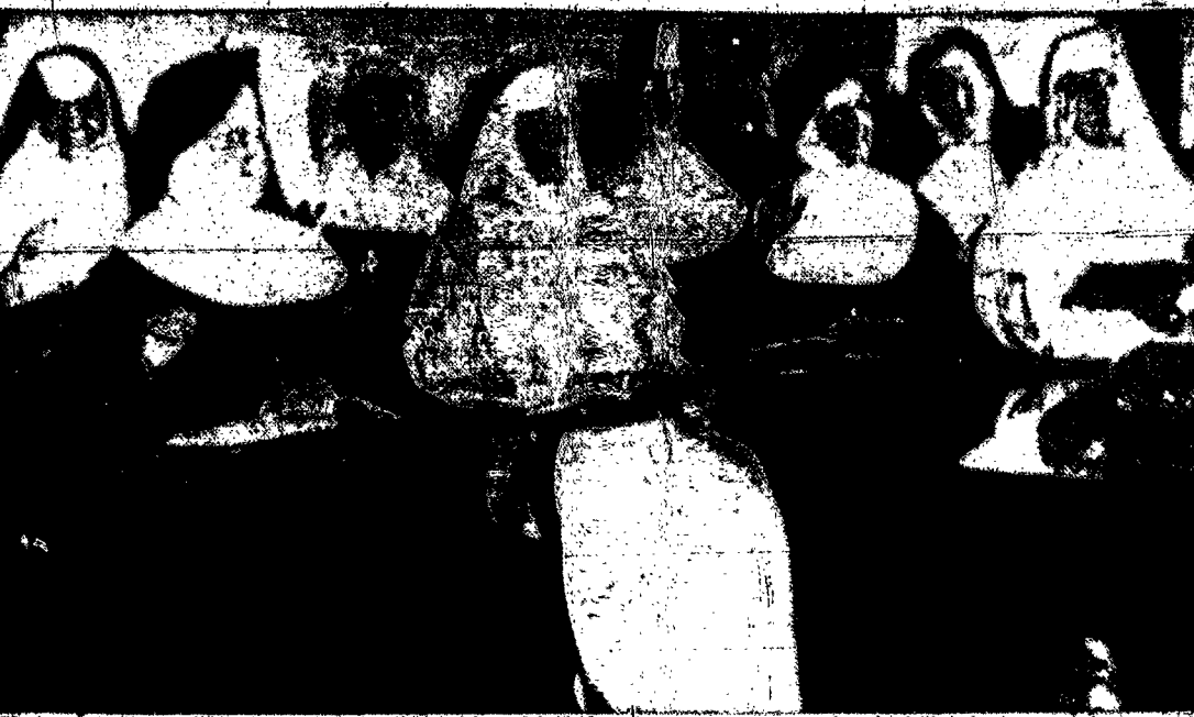
Everybody knows the answer in music class at Nazareth College.