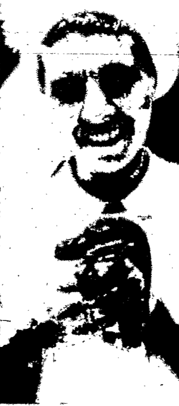
Sister Evangelist holds homely but harmless lizard. Native superstition says lizards bear curse of Mohammed.