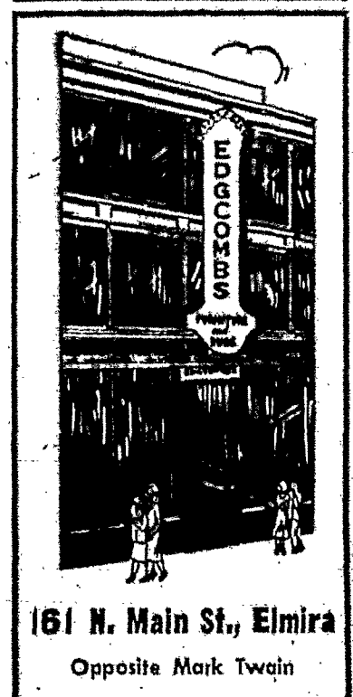
161 N. Main St., Elmira Opposite Mark Twain

Final plans for the affair and committees are to be named at a meeting this week.