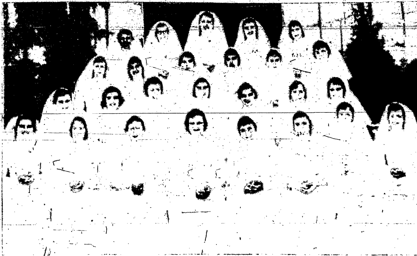
'BRIDES OF CHRIST' — Postulants in their white bridal gowns stand at the Sisters of St. Joseph Motherhouse entrance to begin Wednesday morning ceremony