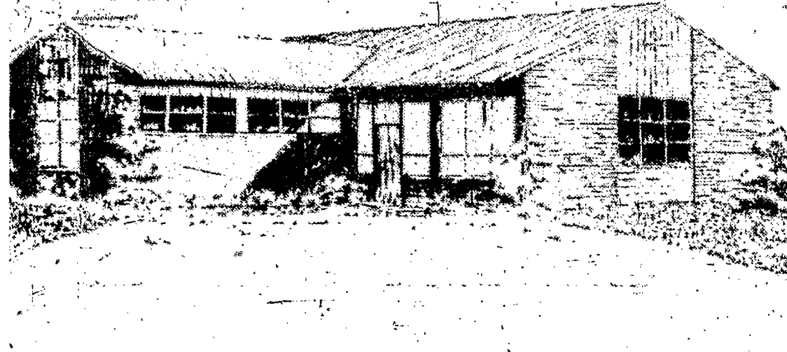
ARCHITECT'S drawing for proposed St. Patrick's, Victor, Religion Center and Parish Hall.