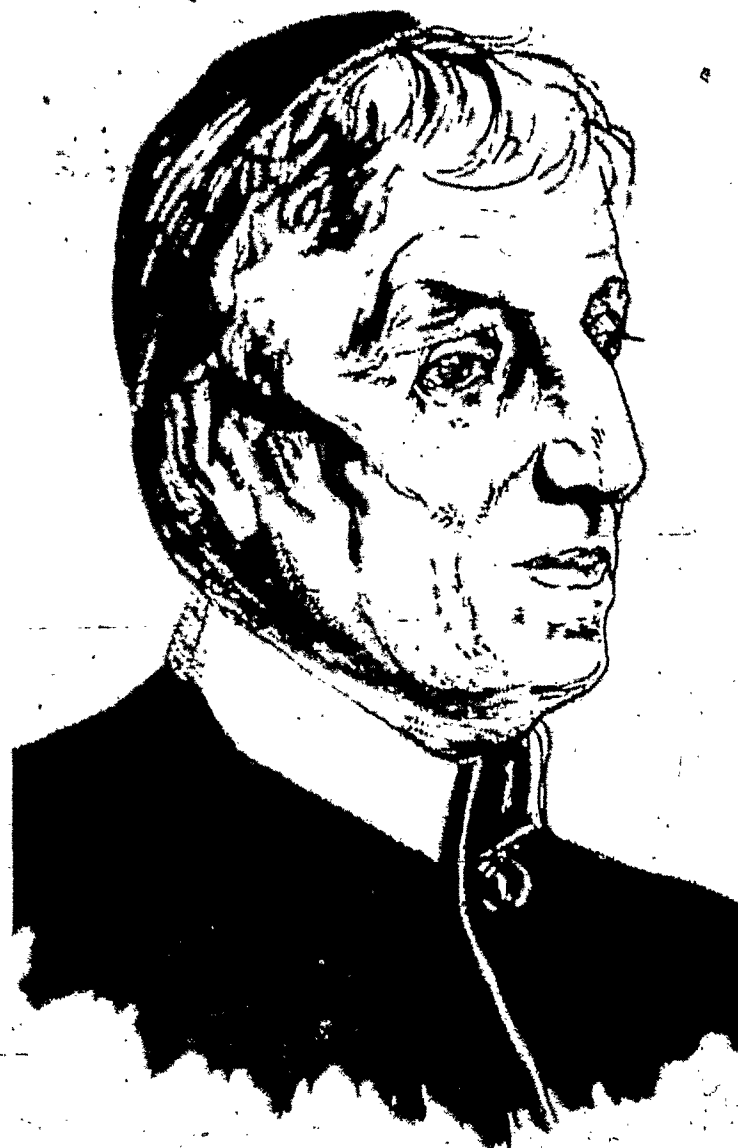
CARDINAL JOHN HENRY NEWMAN

Among Cardinal Newman's most famous works were "Idea of a University," "Apologia Pro Vita Sua" and "Grammar of Assent." He was universally regarded as one of the great masters of prose style. His elevation to the Sacred College of Cardinals was hailed by Catholics everywhere at the time as breaking down the long-existing wall of partition between England and Rome.