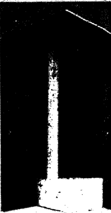
Distinctive entrance of Model Home has illuminated street number identifying RG&E Full Payer Home with Adequate Wiring. Brick planter in foreground will be filled for opening day.

The Rochester Gas & Electric Corporation has graphically demonstrated what it calls "full housepower" in the new model. By "housepower" they refer to certified adequate wiring which permits a family to use electricity safely, comfortably and conveniently. As an added attraction to all visitors, RG&E will sponsor a room air conditioner door prize for which anyone who fills out the application blank properly is eligible.