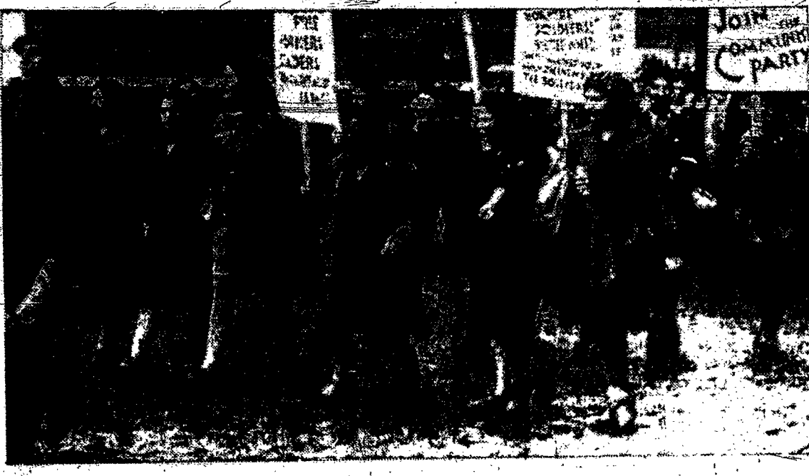
Communist parade in 1930 in New York City shows many women as active members of Red party in U.S.

A writer who quit the Party said he could no longer force himself "to live in the stifling atmosphere of the party line