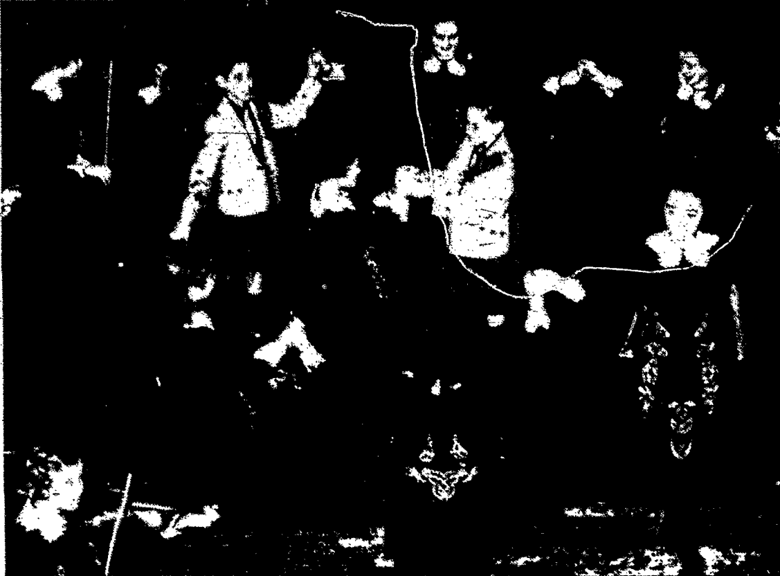
THE LITTLE GAELIC SINGERS —Currently on their second tour of the United States, the Little Gaelic Singers will appear in Rochester on May 6 at the Auditorium Theatre sponsored by the Columban Fathers of Silver Creek.