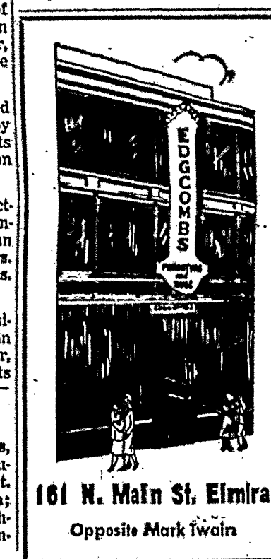
161 N. Main St. Elmira Opposite Mark Twain

Sunday, May 4 — St. Thomas, Rochester; St. Aloysius, Auburn; St. Mary, Corning; St. Agnes, Avon; St. Leo, Milton; St. Joseph, Livonia; St. Catherine, Mendon; St. Patrick, Seneca Falls.