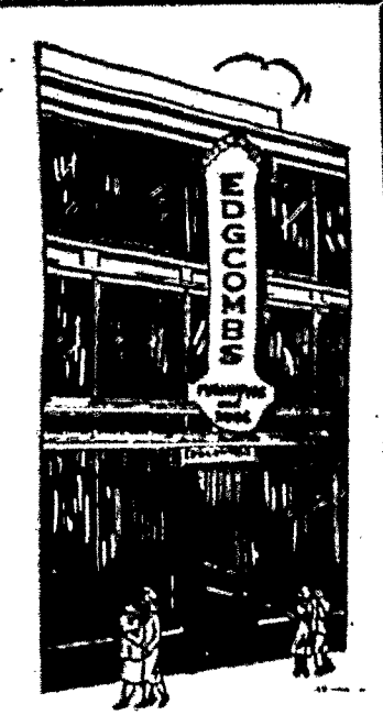
161 N. Main St. Elmira Opposite Mark Twain

Sunday, May 4 — St. Thomas, Rochester; St. Aloysius, Auburn; St. Mary, Corning; St. Agnes, Avon; St. Leo, Hilton; St. Joseph, Livonia; St. Catherine, Mendon; St. Patrick, Seneca Falls.