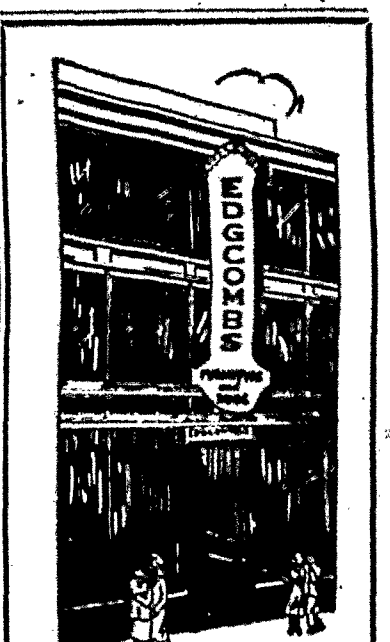
161 N. Main St. Elmira Opposite Mark Twain

Sunday, May 4 — St. Thomas, Rochester; St. Aloysius, Auburn; St. Mary, Corning; St. Agnes, Avon; St. Leo, Hilton; St. Joseph, Livonia; St. Catherine, Mendon; St. Patrick, Seneca Falls.