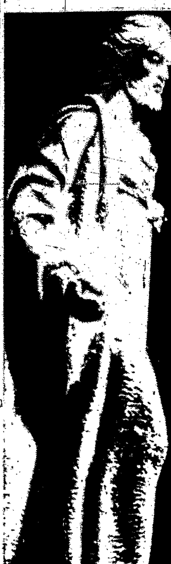
The statue of the Sacred Heart overlooking the city of Guayaquil, Ecuador, will tower 181 feet in height, the tallest statue in the world. Shows here in model form, it is the work of Spanish sculptor Juan de Avalos.