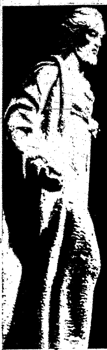
The statue of the Sacred Heart overlooking the city of Guayaquil, Ecuador, will tower 181 feet in height, the tallest statue in the world. Shows here in model form, it is the work of Spanish sculptor Juan de Avelos.