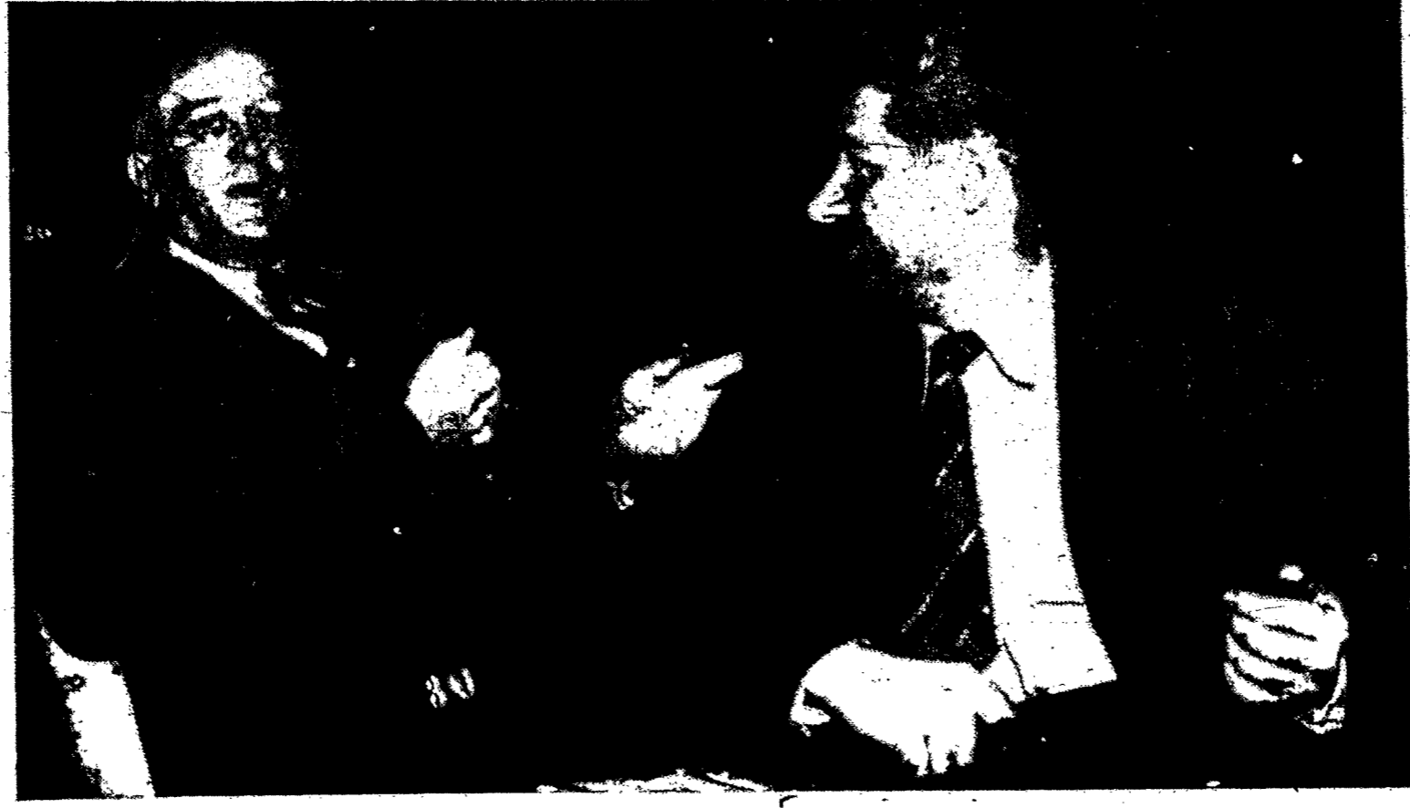
OLD AND NEW BOSSES of the Communist Party, USA: William Z. Foster (left) photographed with Eugene Dennis in Washington in 1947, after Earl Browder was ousted as head of the Party and Foster regained its reins, with Dennis under him as General Secretary.

Action would be drastic, immediate, and without appeal. An armed "Red Guard" would enforce the orders of Party henchmen.