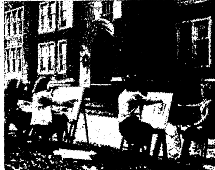
A TYPICAL SPRING scene at Nazareth College. Art Department students doing practical work toward the obtaining of their degree. The department's annual art exhibit will be held at the College next weekend.

HOLY FAMILY PARISH Haubner & Stallnecht FUNERAL DIRECTORS 828 JAY ST. FA. 8-2323