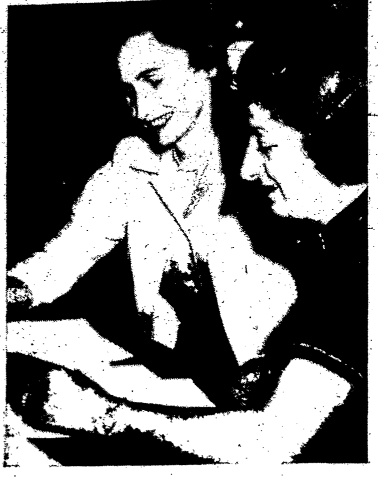
Doctors' Wives Map Dinner