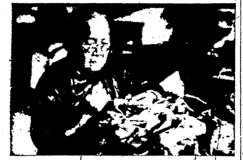
Care For Aged In Missions

At a dinner on the second day Archbishop Richard J. Cushing of Boston and Carlos P. Romulo, Philippine Ambassador to the United States, will speak. Host to the conference will be Cardinal Spellman, Archbishop of New York.