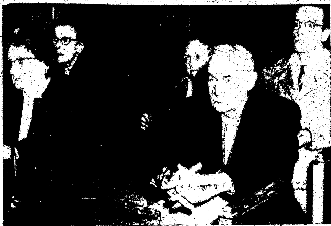
DAILY Mass attendance as encouraged by the Daily Mass League is here typified by a group in St. Joseph Church, Rochester at noon. Other noon-day Masses are celebrated in Our Lady of Victory, St. Mary's, Corpus Christi and St. Patrick Churches, downtown.