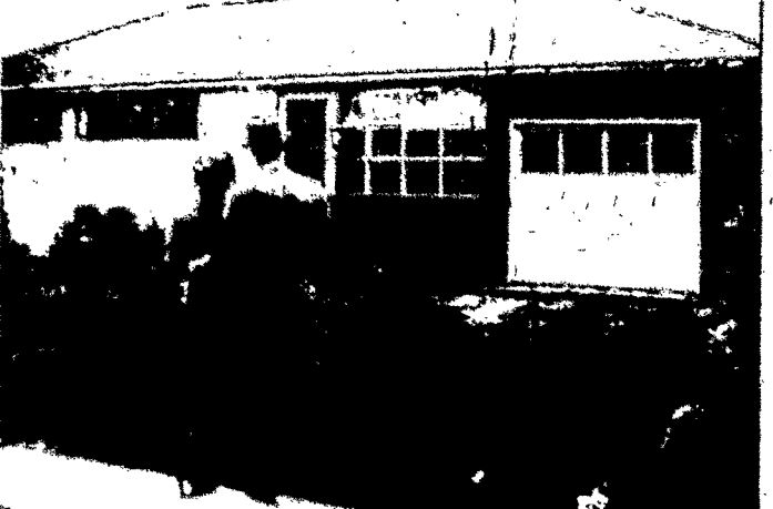
OWN YOUR OWN WITH AN R. S. B. MORTGAGE LOAN

We specialize in helping folks own their own homes. Rochester Savings is not merely a mortgage loan bank. Your home ownership problems receive our undivided attention. There's no red tape... loan applications are processed quickly. As thousands of Rochester folks already know our mortgage loan service is prompt, competent and confidential. Just call BAKER 5-4400 or stop in and let's talk it over... there's no obligation.