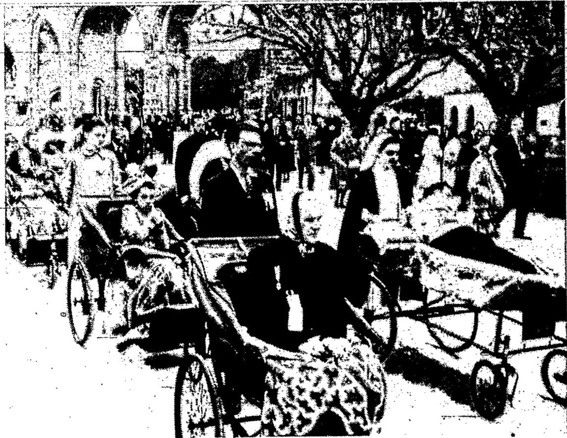
Thousands of the world's sick, crippled, and dying visit Our Lady's Shrine at Lourdes each year, with faith and hope that they might be cured. Their coming is a striking example of love and trust in the Blessed Mother for more than 2-million pilgrims that visit the Shrine each year.