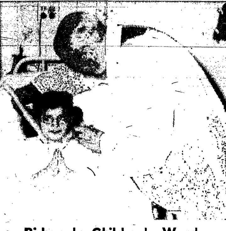
Bishop In Children's Ward

CARMELITES Third Order of Mt. Carmel will meet Sunday, Feb. 9 at 3 p.m. in Our Lady of Victory Church in Pleasant St. Information on the Third Order may be obtained by writing: Carmelite Third Order, 40 Pleasant St., Rochester 4, N. Y.