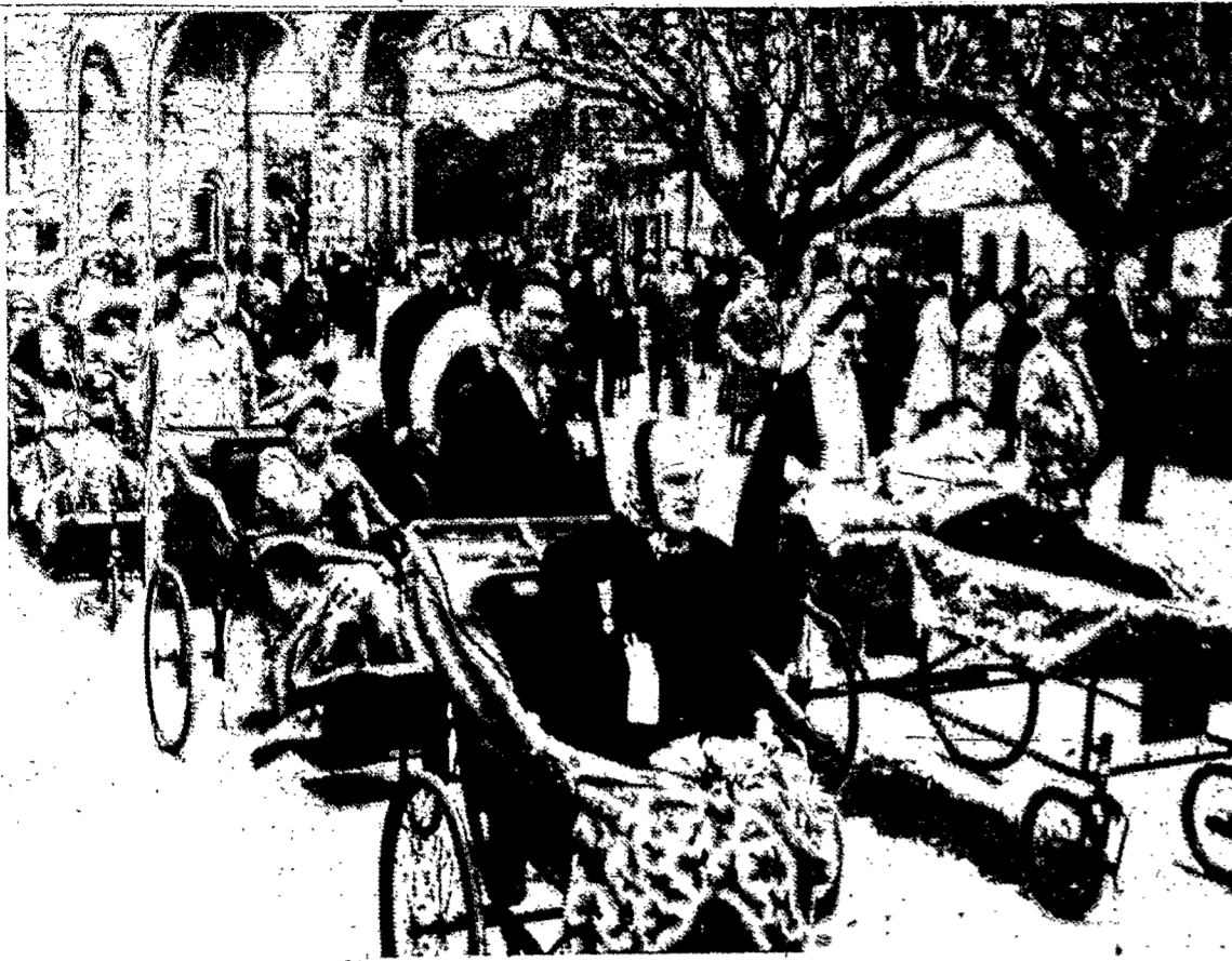
Thousands of the world's sick, crippled, and dying visit Our Lady's Shrine at Lourdes each year, with faith and hope that they might be cured. Their coming is a striking example of love and trust in the Blessed Mother for more than 2-million pilgrims that visit the Shrine each year.