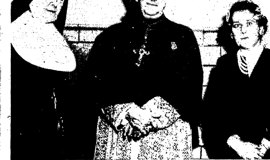
College Guild Meets