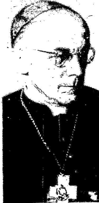
Cardinal Salutes Protestant Leader

East Providence, R.I. — (RNS) — Midnight movies for youth and "lurid and misleading advertising which often accompanies these and other films" were denounced by the Rhode Island State Council of Protestant Churches.