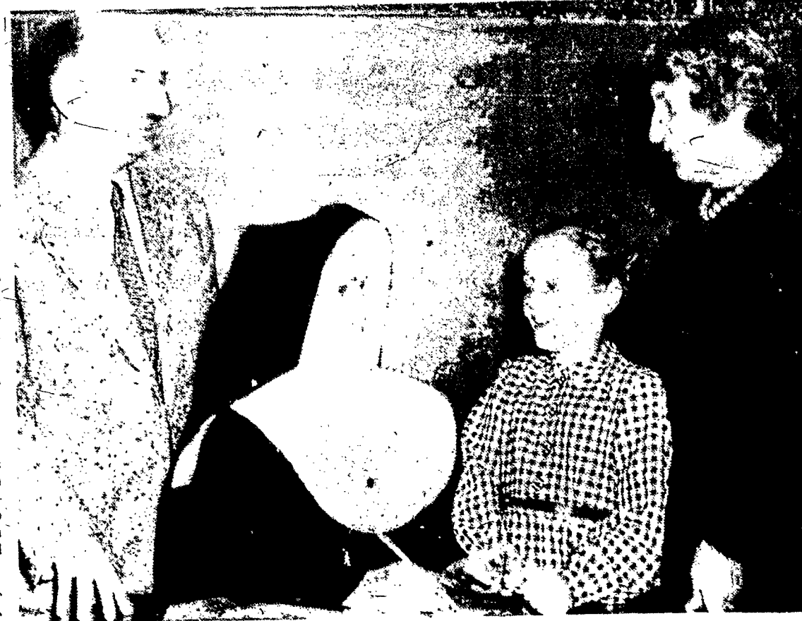
No Red Commissars Here