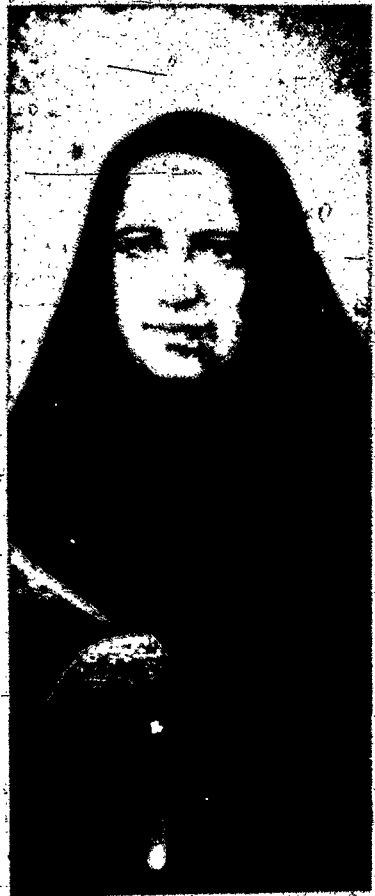
Hollywood To Make Mother Cabrini Film

The demonstrations were conducted by the Canton Bureau of Religious Affairs and the so-called Patriotic Association of Chinese Catholics, the group organized by the Reds in an effort to split the Church in China from the Holy See.