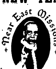
The Holy Father's Mission Aid

THE MISSIO. VRY CHURCH IN THE ORIENT NEEDS YOUR HELP BADLY. PLEASE STRENGTHEN THE WORK OF OUR HOLY FATHER BY REMEMBERING THIS PAPAL MISSIONARY SOCIETY IN YOUR WILL. GOD'S BLESSINGS WILL BE MANY FOR YOU AND YOUR FAMILY.