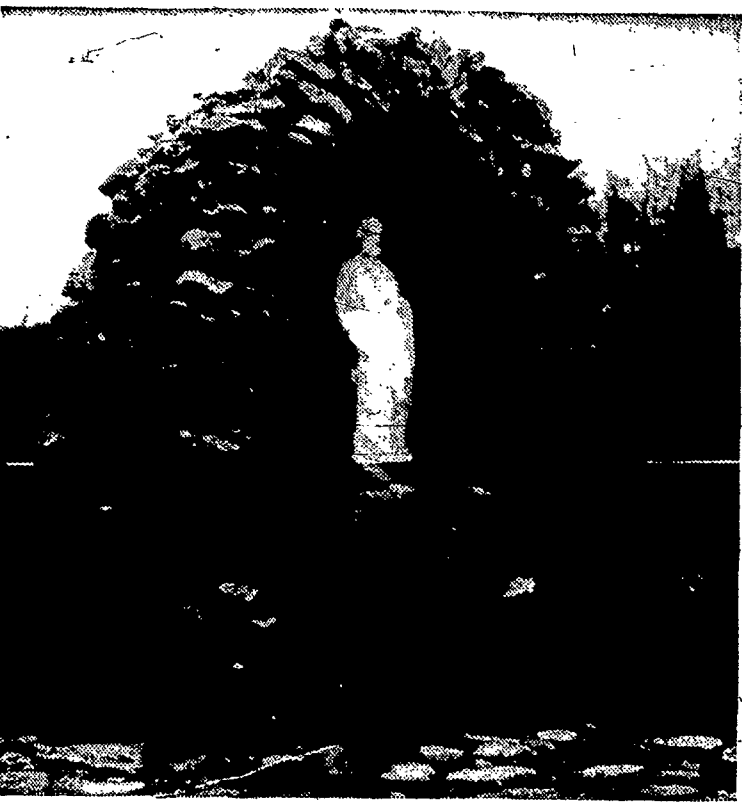
Shrine To St. Jude