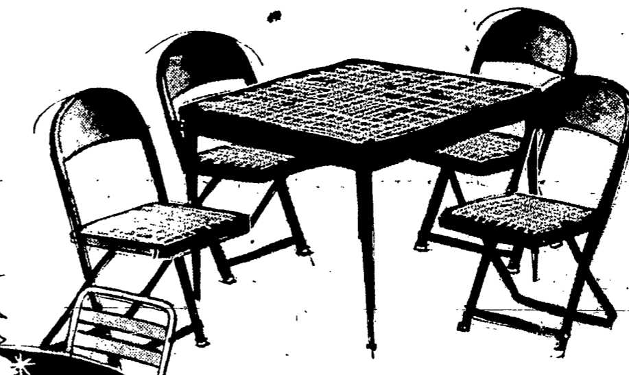
above, 30" square table with deep ribbed frame, tapered leg, upholstered seat on chairs. Table 9.98; chairs 4.98 ea.