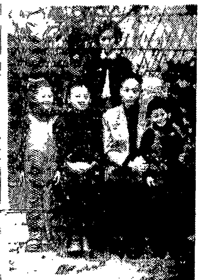
ONE OF THE families benefiting from funds sent to Hong Kong following 1956 Mission Day at Our Lady of Mercy High School.