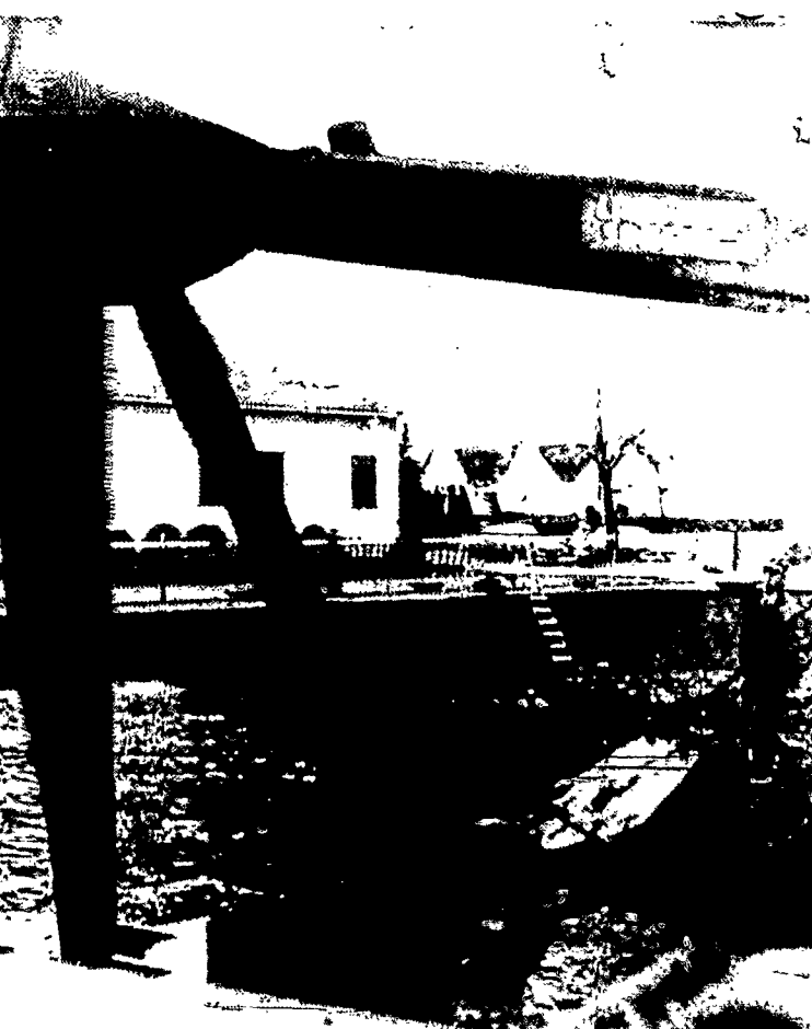
Excavation for new St. Anne's Church, Rochester.

All three parishes have completed successful fund drives in launch their church construction projects. Total cost of the three churches will approach the two million dollar mark.