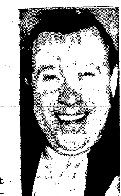
WALTER REUTHER 'crisis is moral'

The problem arose when a Tabbi asked if money is going to Arab schools that teach hatred of Israel. This was followed by two more queries whether UNESCO is supplying