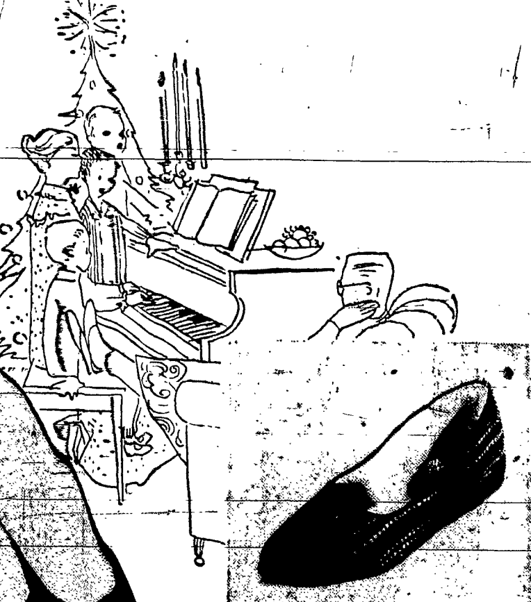
Gold trimmed, sharp toed flat in black or multi-stripe. 5.50