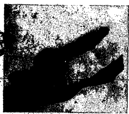
Leather moccasin, shearling cuff. Light blue, red, natural. 5.95