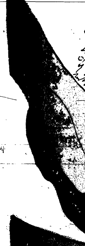
Embroidered satin, black, light blue, pink. 5.00

Mail and phone orders filled . . . phone BAKER 5-3000