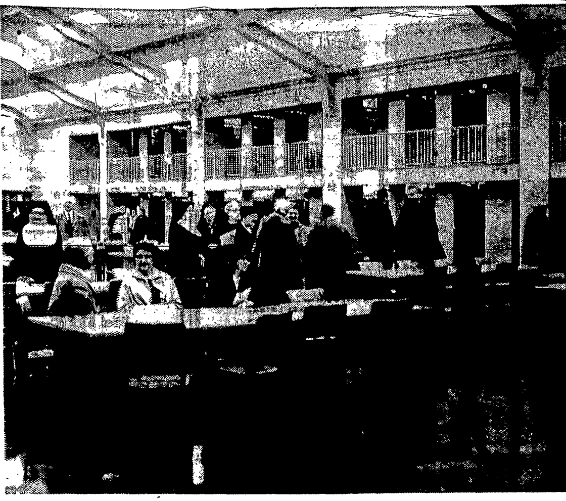
NAZARETH COLLEGE LIBRARY — The spacious, central Reading Room of the new $800,000 Nagareth College Library was a chief attraction for many visitors at Sunday's exercises dedicating the newest facility of the women's educational institution conducted ced today. by the Sisters of St. Joseph. With a current catalogue of almost 40,000 books, the new library has facilities for 100,000 volumes.