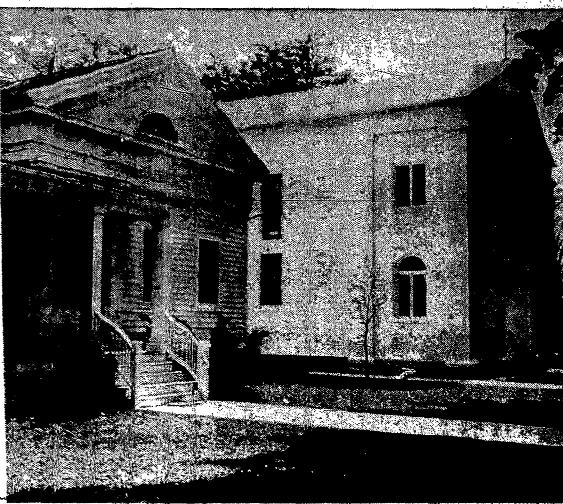
St. James Church and Rectory, Trumansburg

Property for a parking lot on the corner of Whig and South