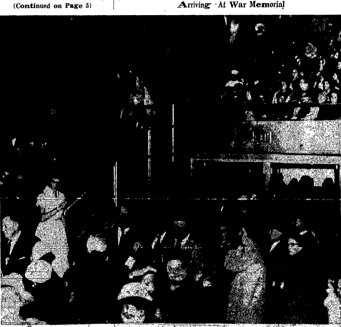
THEY CAME EARLY - The Sunday turnout for Bishop Kearney Day set a new attendance record at the Rothester War Mexicolal Firemen closed doors a half hour before the scheduled opening of the ceremonies at 4:80 p.m.