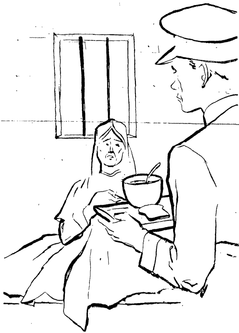
"We want no martyrs!"

Electric Shavers, Sunbeam Remington, Black, Frigidaire, Vitrol, & Hoover, Singer, all Main St. — Adv.